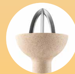
GREEN TOOL CITRUS PRESS

Whether you're a vegetarian, vegan or just want to eat less meat, the Green tools collection helps make vegetable-based cooking a breeze. With an increased focus on meat-free diets, it's so easy to find delicious and creative vegetarian recipes that promote healthy living and are good for the environment. Be inspired by the tasty recipes on this page.