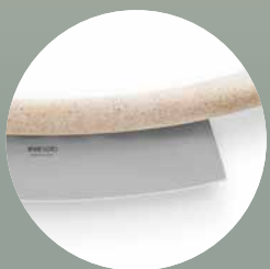
GREEN TOOL HERB CHOPPER

Finely chop the garlic, parsley, coriander, oregano and chilli. Stir in the vinegar and oil, and season with salt. Serve the grilled vegetables with the chimichurri.