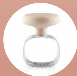
GREEN TOOL GARLIC MASHER

Break off the ends of the asparagus stalks. Steam the asparagus for 1 minute in salted, boiling water. Drain. Arrange the asparagus and lettuce on plates. Top with pea shoots and mozzarella, and finish with the dukkah. Serve immediately.