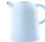
502720 Thimble vacuum jug 1.0 l Soft blue