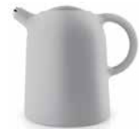
502716 Thimble vacuum jug 1.0 l Marble grey